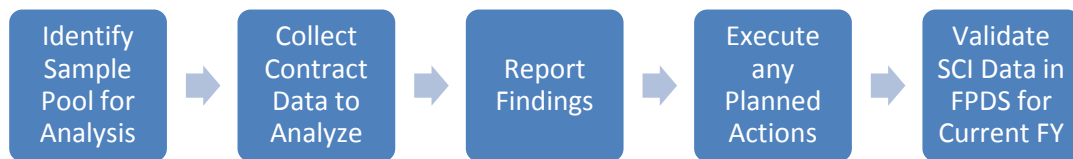
Figure 1: Analysis Process

In preparation of the Service Contract Inventory and Analysis Report, a working group was established consisting of representatives from each of DOC’s five Bureau procurement offices. As a result of the collaborative effort of the working group, a repeatable process, as depicted in Figure 1, was developed to comply with the annual service contract inventory requirements.